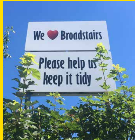
Main image Volunteers make The Station Crew what it is

The Station Crew was formed to address urgent repair issues at Broadstairs Station and to improve the 'arrival' experience. The team worked with Southeastern and Network Rail, and as a result, we have seen CCTV installed, the ticket office repaired, guttering problems resolved and drainage issues investigated.