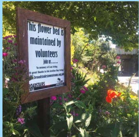
Main image Volunteers working on Crampton Tower Bank

- We recently started work on the Embankment by The Library and are planning a wildlife friendly garden.