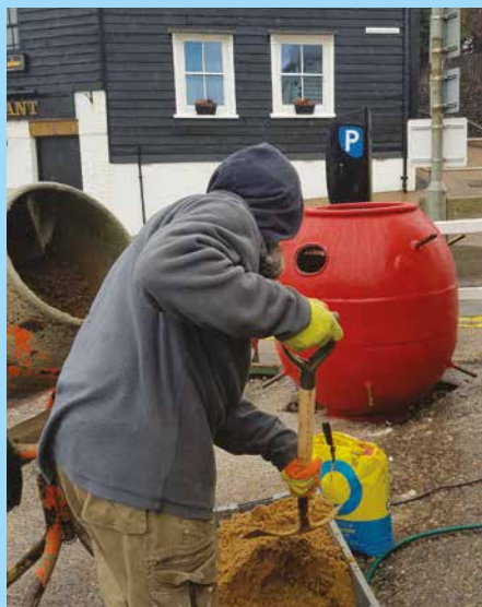
Main image Work in progress on The Boat House aka 'Old Wonky

The Harbour and Seafront Group's success means they plan to form a separate Charity, whose primary focus will be securing the Lookout's long-term future.