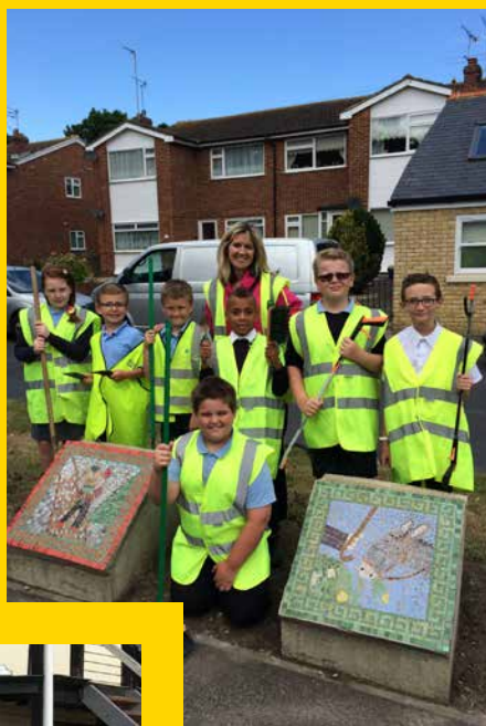
Above The youngest team members who worked on the Dickens Mosaic project

Liaising and working with other local groups and volunteers of all ages is at the heart of all Town Team projects'.