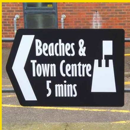
Above New signage installed at Broadstairs station helps visitors with wayfinding and to discover more about our town