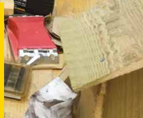
Above and left Learning and sharing skills