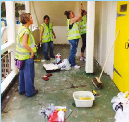
Left and below Work underway on the 'zigzag' steps. EKC students getting involved.