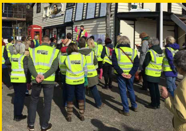
Left Volunteers being briefed for BBC Radio Kent's 'One Good Deed' event.